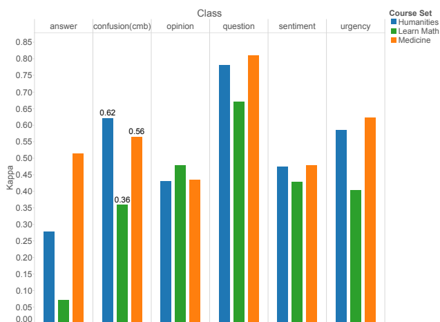
Figure 2: Constituent Classifier Performance. Confusion(cmb) is the combined classifier.

Figure 2 illustrates the performance of each constituent classifier when cross-validating on the humanities and medicine course sets, as well as on the education course. The constituent question classifier outperformed all the others by a large margin, likely because the structure of questions is fairly consistent. Note that the constituent classifiers were not themselves fed by a lower level of classifiers; if we were attempting to predict, say, sentiment instead of confusion, we could try to improve over the performance shown here by creating a sentiment combination function that was informed by its own set of constituent classifiers.